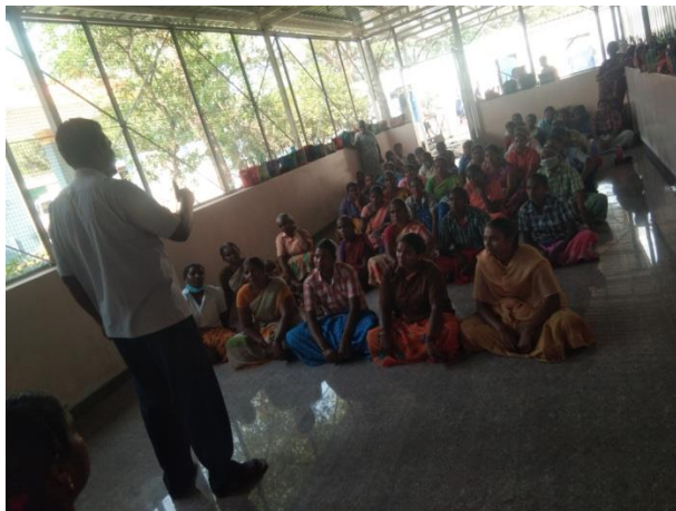
KGR Spinning Mills (P) Ltd,Paruthikadu,

This committee is meant exclusively for solving the sexual abuses of the women and girls. The training should be conducted to all male and female workers. The senior women worker would be the President of the committee with four members. 50% of the members will be from women workers. The duration of the committee valid is for three years. The committee has power equal to civil court. The committee should be informed within three months from the date of incident happened. Report is to be submitted. This committee will act as a bridge between the management and the workers.