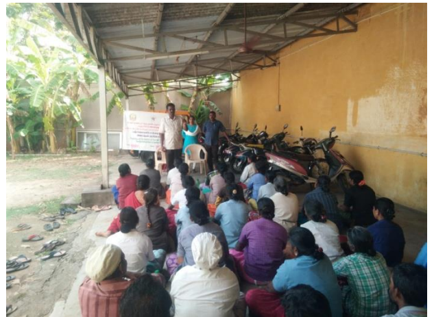
Golden Spinning Mills (P) Ltd, Selliampalayam